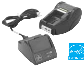
Shown with printer for reference purposes; printer is not included

The smart charger will fully charge a single standalone QLn smart battery in less than four hours. In addition to indicating battery charge status, it indicates battery health, allowing you to more accurately manage your spare battery pool. Specifically, LEDs show whether the battery is "good," has a "diminished capacity," is "past useful life," or is "unusable" and should be replaced. The smart charger comes with a charging base and power cable.