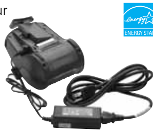
Shown with printer for reference purposes; printer is not included

Connect the AC adaptor to your QLn printer and mains socket to charge the printer's smart battery whilst in the printer. The printer can print labels and perform other functions during charging.